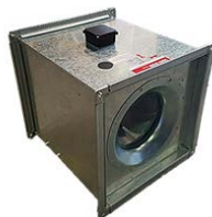
INLINE CENTRIFUGAL FANS