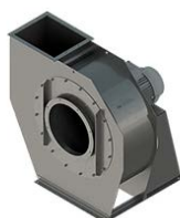
SINGLE WIDTH SINGLE INLET CENTRIFUGAL FANS (SWSI)