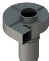
CYCLONE DUST COLLECTORS