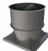
ROOF MOUNTED EXHAUST FANS