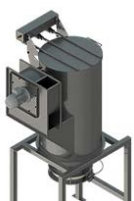
REVERSE JET DUST COLLECTORS