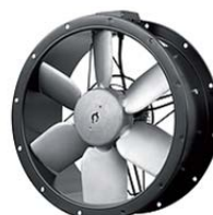
TUBE AXIAL FANS