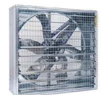
WALL MOUNTED FANS