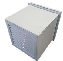
FILTERED AIR SUPPLY UNITS (FASU)