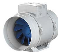
MIXED FLOW FANS