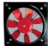
PLATE MOUNT AXIAL FANS