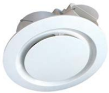
CEILING EXTRACTOR FANS

Unmatched in the industry, our reduced levels of complexity to solve problems allow Sigris Design to quickly make changes to a whole range of products. This flexibility within our range allows you to meet site dimensions and changing requirements, with minimal disruption to your projects, and we pride ourselves on getting it right the first time.