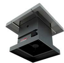
ROOF MOUNTED SUPPLY FANS