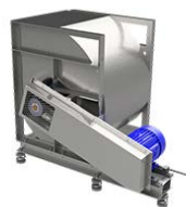
DOUBLE WIDTH DOUBLE INLET CENTRIFUGAL FANS (DWDI)