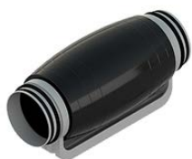
SILENT MIXED FLOW FANS